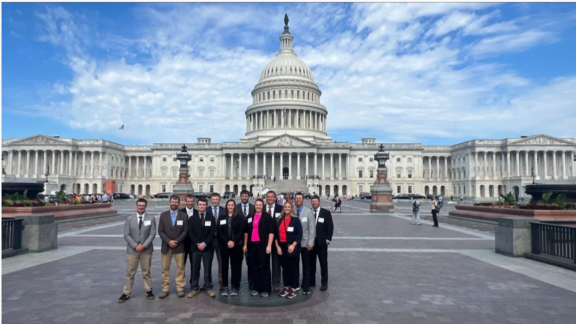
The 12 members of the GROUNDWORK24 cohort pictured in front of the U.S. Capitol in Washington DC.

In addition to the work learning about policymaking and advocacy at a federal level, participants received a guided tour of the Capitol, was able to attend a session of the House of Representatives with gallery passes arranged by Congressman Flood's office, toured the White House, and visited several of our country's monuments along the Washington DC Mall.